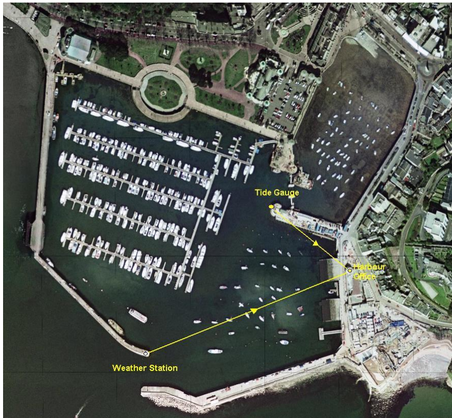
Plan showing layout of weather & tide systems

Torbay estuary provides a natural refuge for shipping from South Westerly gales in the western approaches to the English Channel. The Torbay harbour authority consists of the ports of Brixham, Paignton and Torquay and is administered by the Torbay local council authority, their requirement was for a system providing both 'live' weather and tide information together with accurate records.