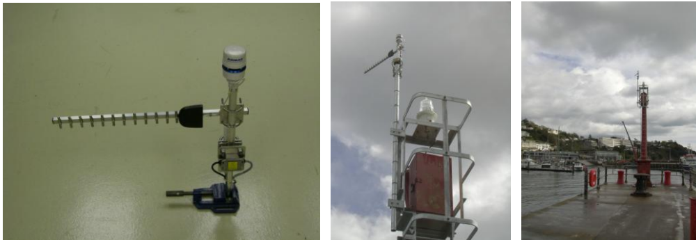
The weather station/radio cluster

The remote weather station is a solid state Airmar LB100 sensor, Pacific Crest EDL2 radio and a YAGI antenna mounted on a leading light at the harbour entrance, the position mounted on the breakwater at the entrance to the harbour giving realistic wind conditions to mariners travelling outside the harbour. The cluster is powered by 12v DC derived from the existing mains electricity source within the harbour light housing. The area is open to the public and the first installation was disrupted by vandalism when a fire was lit under the wooden boardwalk which destroyed the power supply to the light.