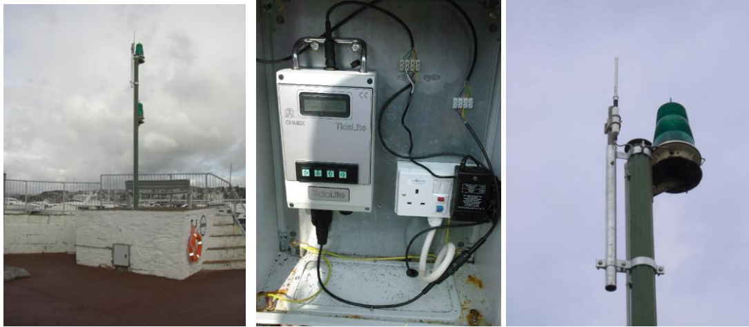
Tide Gauge mounted on harbour wall

TidaLite includes a barometer so the standard unvented transducer can be corrected for atmospheric pressure variations. The transducer has been fitted inside a 50mm scaffold tube for safe deployment alongside active moorings. In addition to saving data internally the TidaLite will calculate and save the Significant Wave Height (as defined by Draper/Tucker analysis) together with the measured Full Wave frequency. This wave information is becoming increasingly important in the definition of inclement weather periods during dredging and coastal engineering operations.